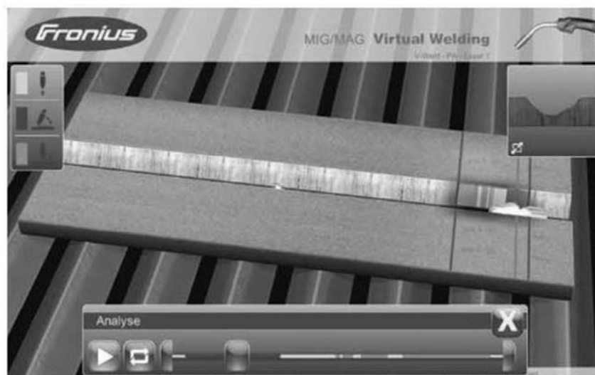
Figure 4. Prototype of the analysis module as developed for the Fronius Virtual Welding® training system.

Slika 3. 3D vizuelizacija numeričke simulacije sa rezultatima izračunatim programom SimWeld® DLL reprodukovani na simulatoru Fronius Virtual Welding®