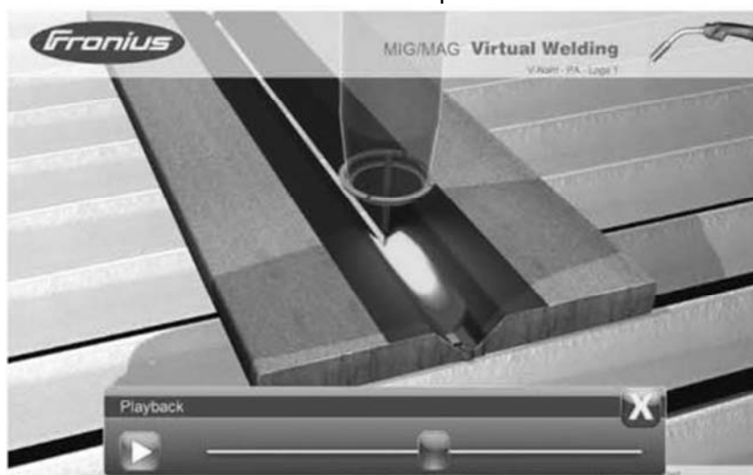
Figure 3. 3D visualization of numerical simulation overall results calculated by SimWeld® DLL in the Fronius Virtual Welding® playback view.

Korisnički interfejs će takođe sadržati prikaz virtuelnog preseka zavarenog spoja, čime se omogućava korisniku da pomeri pogled duž linije zavarivanja. Slika 4 prikazuje prototip modula za analizu, gde su kao primer označena kritična područja rezultirajućeg šava, označena različitim bojama (zelena, crvena i žuta), što ukazuje, na primer, da gorionik nije bio pod dovoljnim uglom u ovom položaju ili je u pitanju neka druga nepravilnost.