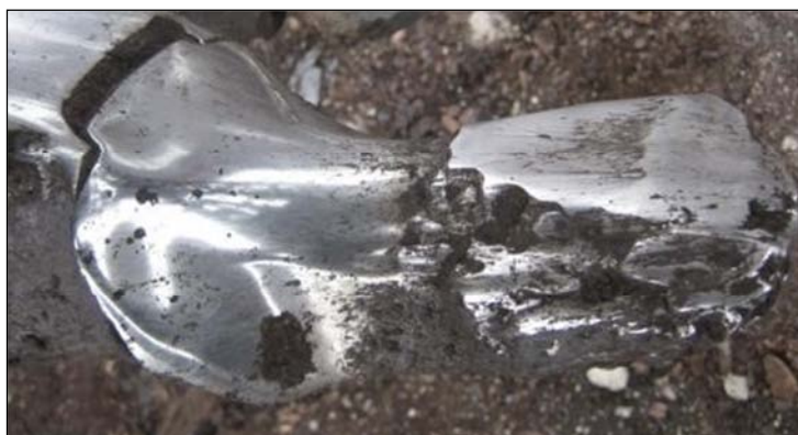
Figure 2. Delamination of hardfaced layers

balanced criterion between a relatively good toughness and enough hardness to withstand abrasive factors. Nevertheless, under load, the teeth coated with hardened materials may be subjected to cracks propagating through the thickness of the coating or interfacial decohesion (Figure 2) which leads to failures.