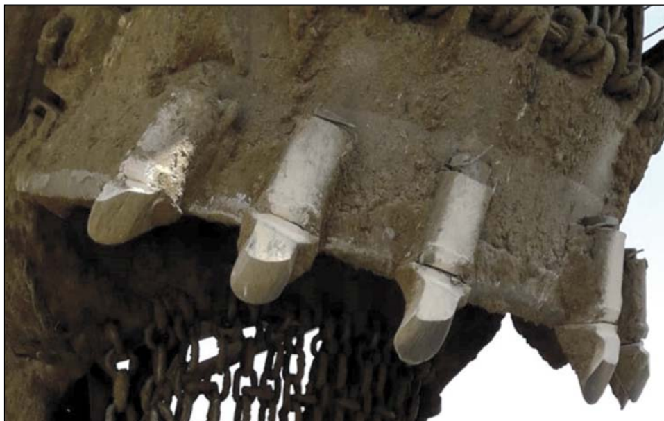
Figure 6. Influence of tooth position on degree of abrasion in SRS 2000 rotor excavator

are previously coated with hardfacing alloy on one side.