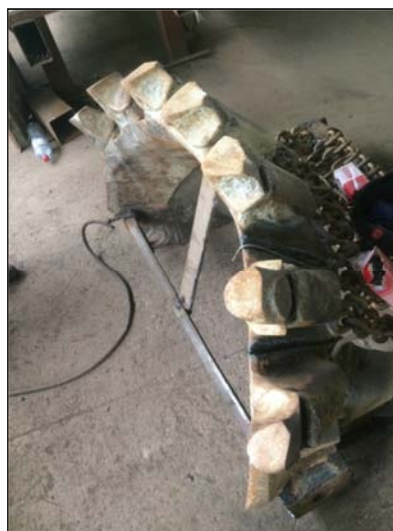
Figure 1. Blunt bucket teeth